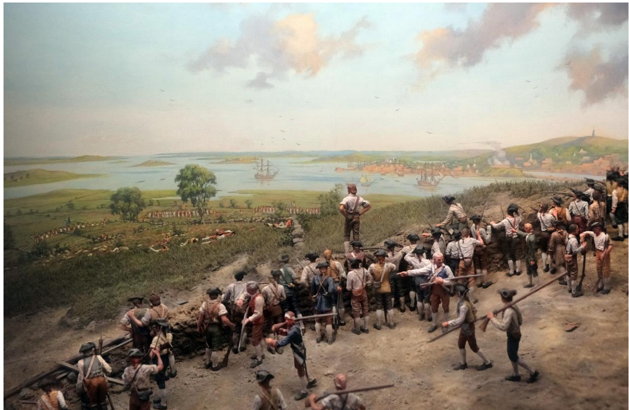
Diorama by Theodore Pitman